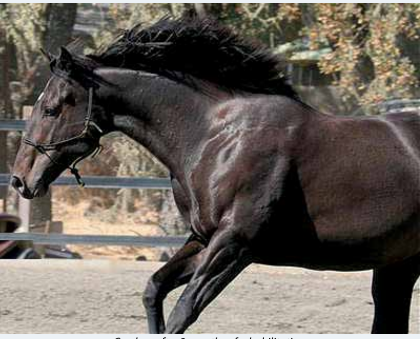
Cowboy after 3 months of rehabilitation.

Cowboy was purchased by a concerned passer-by and taken off the property to a new home. The new owner immediately