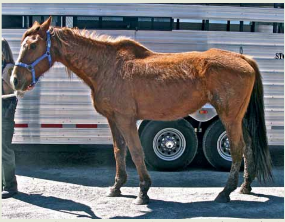
Mindy on Day 1 of her rehabilitation. She was 300 lbs underweight and afflicted with a fungal infection covering most of her body and extensive dermatitis on all four limbs from standing in mud for a long period of time. Can this be the same horse pictured in the left photo?