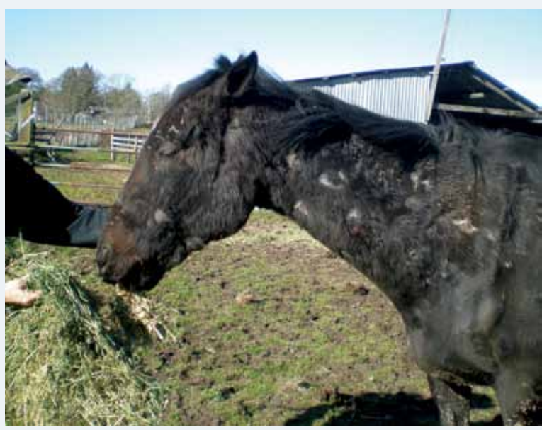
It is hard to imagine that Cowboy was in such a condition, looking at his healthy, recovered state at left.