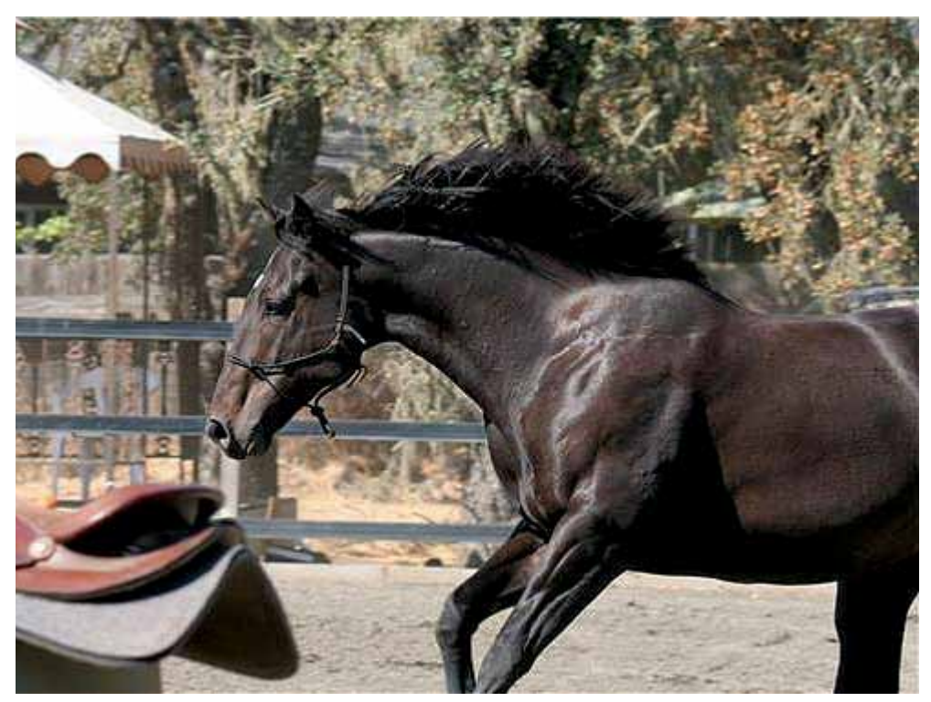
This beautiful horse named Cowboy was rescued when he was 500 pounds underweight. Through the Sonoma County CHANGE program, he was provided all the medications and supplies, supplemental feed, veterinary services and TLC he needed to bring him back to life as you see him here. Read his story inside.

Malnourished and poorly cared for horses can be found even in a country